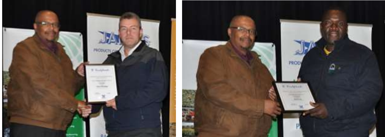
Vencor Holdings (High Throughput)