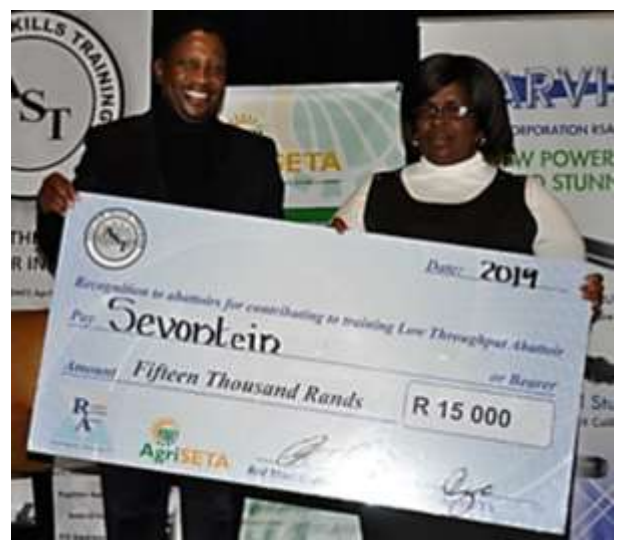
Sevontein Correctional Services Abattoir Kwazulu Natal