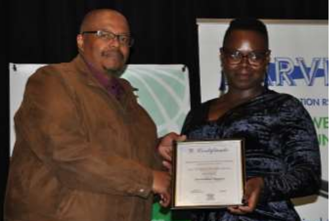
Dreamland Piggery (Low Throughput)