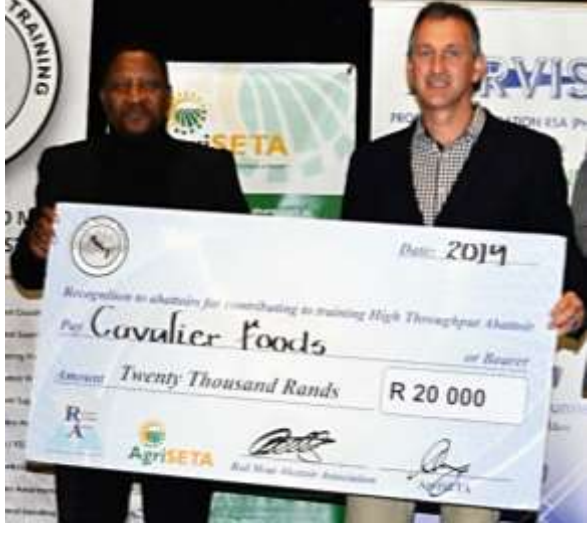
Cavalier Group – Gauteng