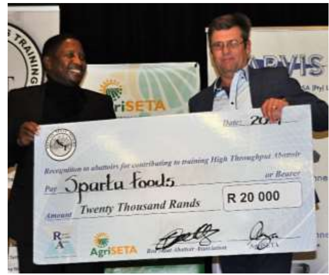
Sparta Foods – Free State