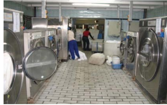
Anglo Plats Modikwa Mine