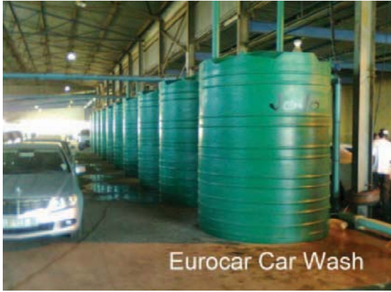
Eurocar Car Wash

Treatment of grey water | Membrane filtration | Car wash systems