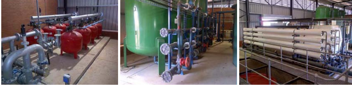
Lynnwood Bridge Water harvesting to toilet flush

Dube Tradeport – filtration of rain- & borehole water and sewage effluent 120m3/h