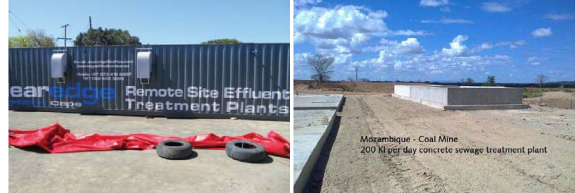
Mozambique - Coal Mine 200 Kl per day concrete sewage treatment plant