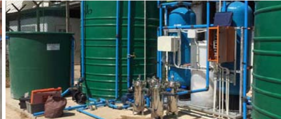
PPC Sub-surface water treatment