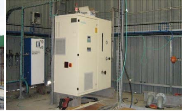
Ushaka Island Aquarium