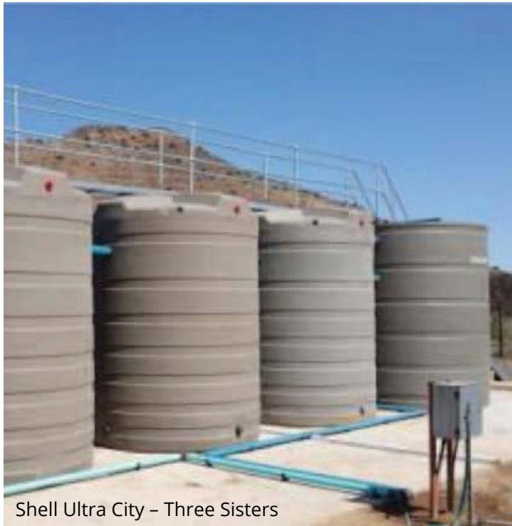
Shell Ultra City - Three Sisters