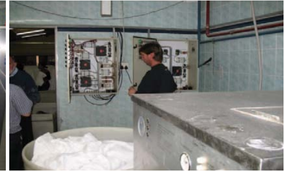
Anglo Plats Modikwa Mine