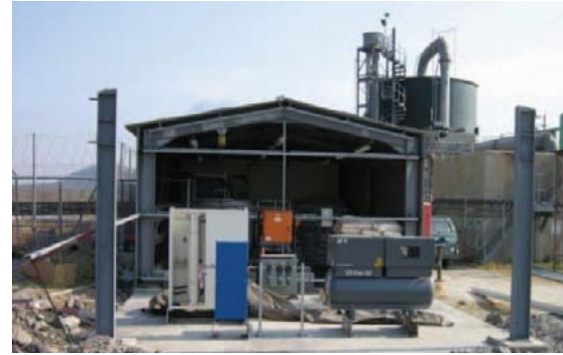
Plettenbergbay / Midvaal SASOL