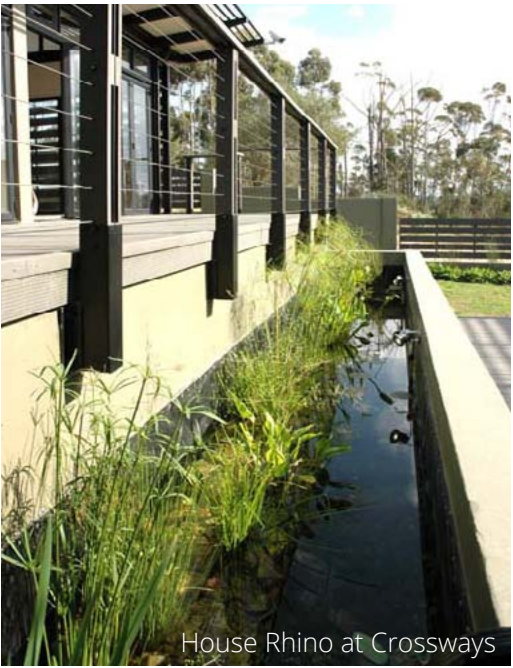
House Rhino at Crossways